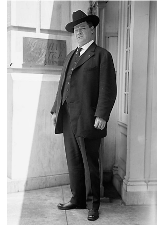
William Dudley Haywood

He was convicted in two towns, but in the third, the prosecutor refused to move forward with the case.